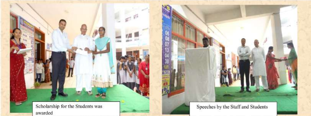
Scholarship for the Students was awarded